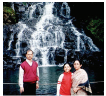
Days at NBMCH-1987